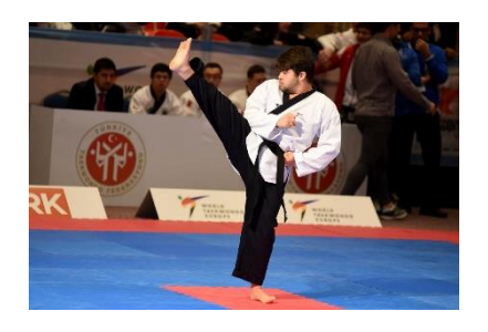
World Para Taekwondo Staff